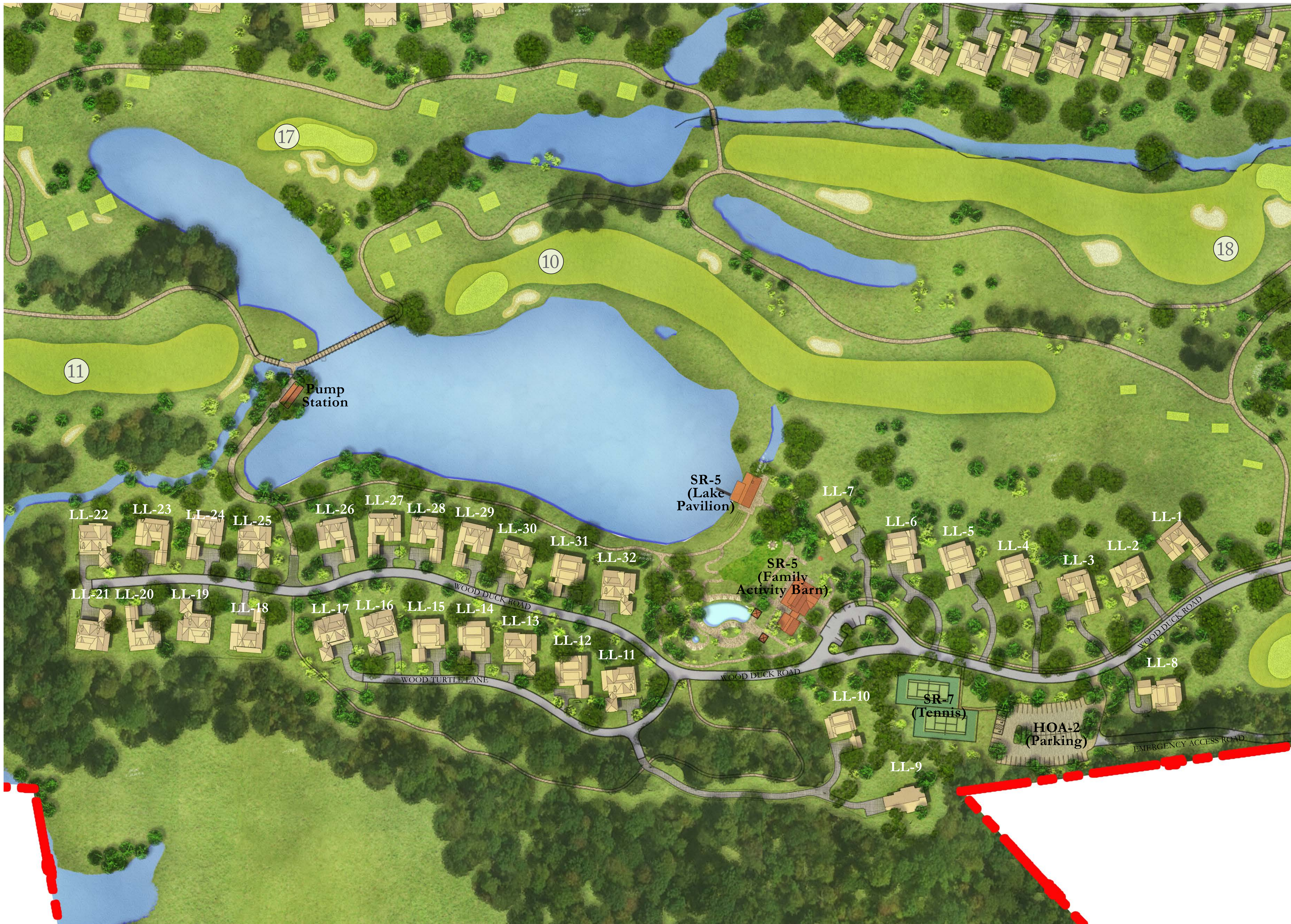
SITE PLAN - SOUTH LAWN